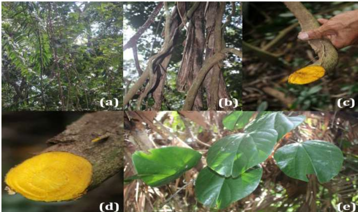
Figure 2. (a) Full view of the vine intertwined among the vegetation. (b) Close-up of its woody stem structure. (c) Freshly cut stem of Arcangielisia flava showing its distinct bright yellow interior. (d) Close-up of the cross-section. (e) Close-up of A. flava leaves, showcasing their broad, heart-shaped structure.